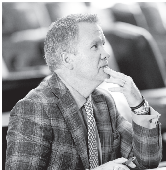
Rep. Cook deliberating legislation on the House floor.

The Legislature maintained its commitment to retired teachers, to promote transparency for parents in relation to their child's education, to ensure our schools are safe, and to fully-fund public education. In addition to $5 Billion new dollars appropriated to public education in our state's budget, SB 10 provided for a cost-of-living adjustment for retired teacher pensions. HB 1605 improved access to curriculum for parents, creates an opt-in program for school districts to use standardized materials, and establishes a mechanism for parents to trigger an audit of curriculum rigor. No child, teacher, or staff member should feel unsafe in our public schools – HB 3 required an armed security guard during school hours, required mental health first aid training for teachers, and appropriated $15,000 to each campus to shore up safety and security measures. Additionally, HB 669 required installation of silent panic buttons in every Texas classroom.