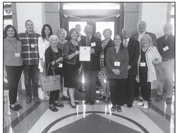
It is always fun seeing folks from home. Enjoyed visiting with this group from Fairview.

HB 1927 The Firearm Carry Act allows all law-abiding Texans age 21 and older to carry a holstered handgun for personal protection if they are qualified to purchase a gun legally in Texas.