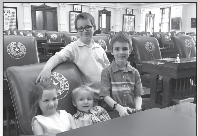
I love showing children around the Capitol. Here's four of my grandkids at my desk on the House Floor.

Please do not hesitate to reach out if you have any questions, comments, or concerns!