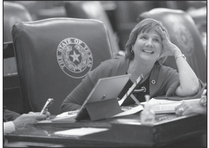
Rep. Noble working with colleagues on the House Floor.

Texas is well-known as a pro Second Amendment state. This session, the Texas Legislature made sure the Lone Star State stays that way by passing several priority bills to protect gun rights for Texans.