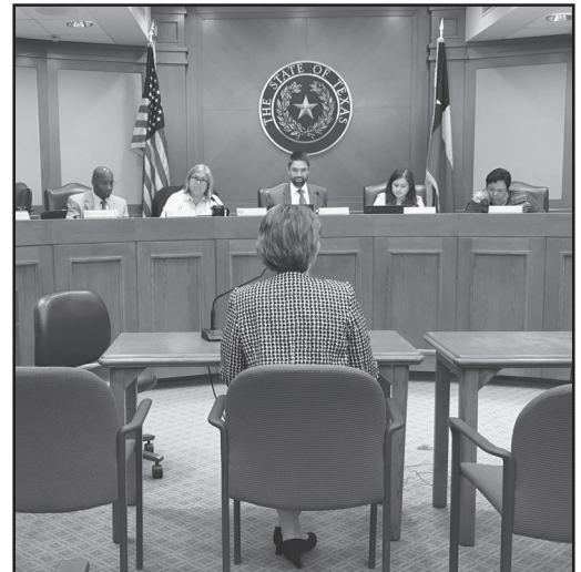
Laying out HB 3081 before the Judiciary & Civil Jurisprudence Committee.