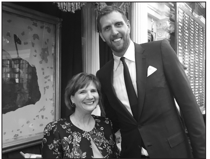
Dirk Nowitzki was honored in the Texas House.