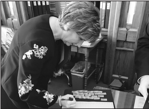
Adding my name to one of the 62 bills I authored, joint authored or co-authored.

SB 535 Restores the rights of places of worship to decide whether licensed carry is permitted on their premises.