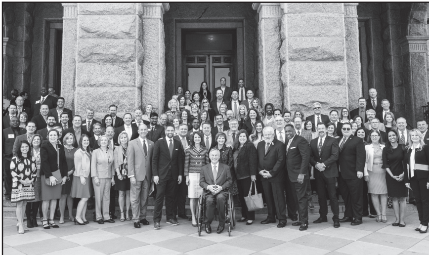
Collin County Days at the Capitol.

Summary: Currently, our Texas Constitution does not allow law enforcement agencies to transfer ownership of any valuable property to a person or organization for free. This includes service animals such as a police dog or horse. The passage of Prop 10 would allow for the ownership of animals retiring from service to be simply transferred to their handler or another qualified caretaker without cost.