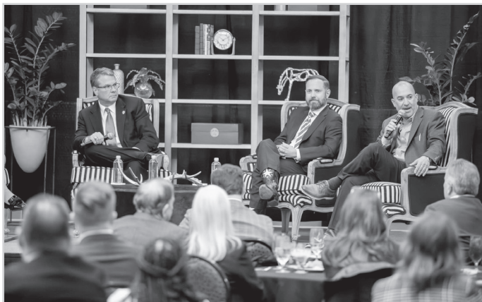
Representative Tepper participates in the Lubbock Chamber of Commerce's Legislative Appreciation Luncheon with Senator Charles Perry and Representative Dustin Burrows.

I believe each person should have the right to decide whether to receive the COVID-19 vaccine. During the pandemic, many employers required their employees to receive the vaccine or face termination. Reports now show that the vaccines and booster vaccines had little to no effect on the spread of the virus or protection from the virus. The current Presidential