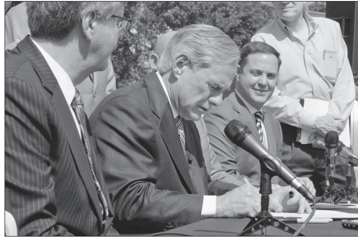
Governor Abbott joins House and Senate leadership to sign the Property Tax Reform bill.