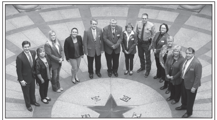
Monahans Legislative Day

The Health and Human Services Commission has been directed to evaluate options to address the most prevalent causes of maternal death, such as postpartum depression. Legislation we passed at the Capitol this year will also screen pregnant women for substance abuse and domestic violence, and provide needed treatment and resources to expectant mothers and new mothers.