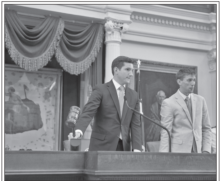
Rep. Landgraf Presiding Over House of Representatives

Texas Fuels legislation I authored was signed into law by Gov. Abbott and serves as a major win for the Texas energy industry, particularly in the Permian Basin. As a result of my legislation, Texas government fleet vehicles will now be running on natural-gas based fuels. In effect, our state's fleet vehicles can now run on fuel that is abundantly found here in the Permian Basin. The other impacts of this legislation will be that there is more transparency in certain taxes and fees, economic and job opportunities in natural-gas producing regions of the state will increase, and the air in Texas will become cleaner. Importantly,