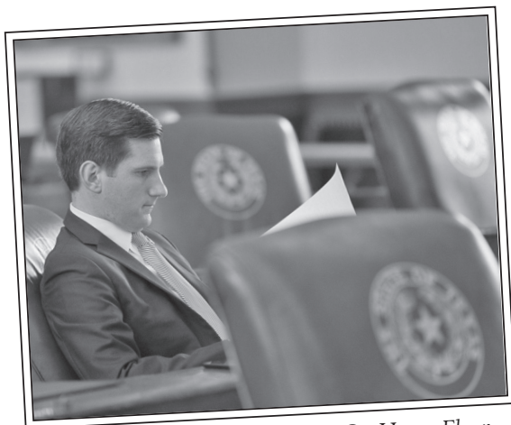
Rep. Brooks Landgraf At Work On House Floor

Energy Resources • Environmental Regulation Local & Consent Calenders