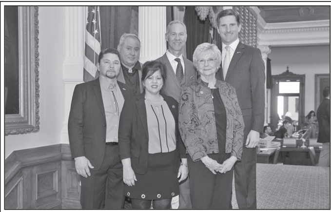
Andrews County Legislative Day

NOTES: (1) Includes certain anticipated supplemental spending adjustments if applicable. (2) Excludes Interagency Contracts. (3) Biennial change and percentage change are calculated on actual amounts before rounding. Therefore, figure totals may not sum due to rounding.