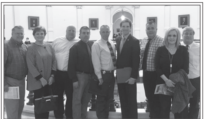
Winkler County Legislative Day