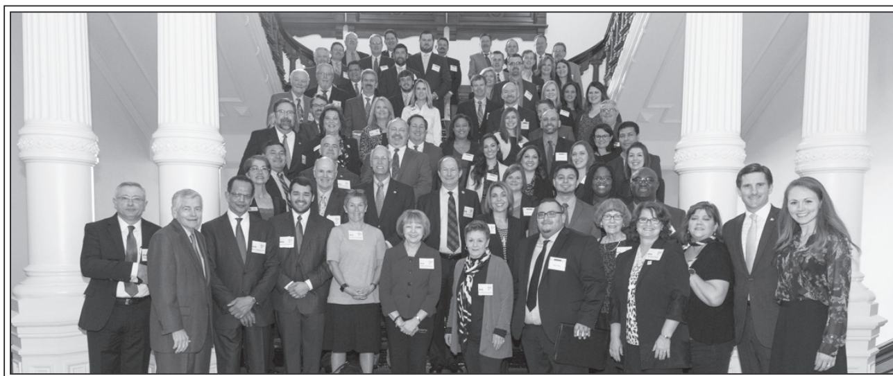
Odessa-Midland Legislative Day