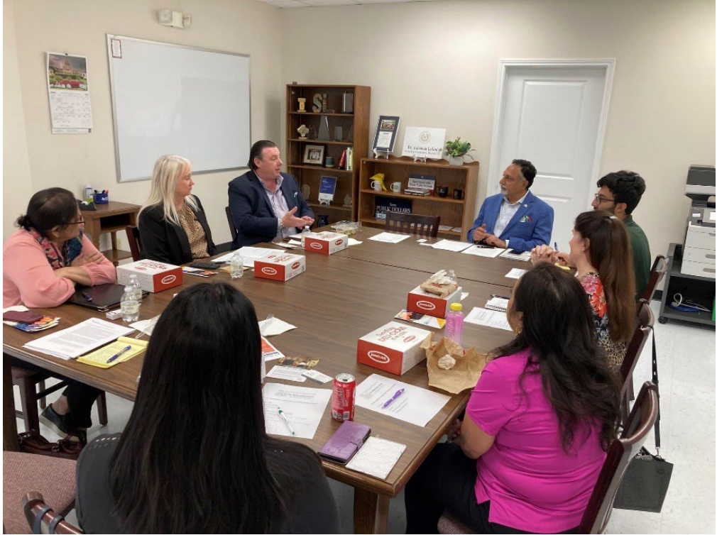
Hope For Three Second Annual Family Fun Fest