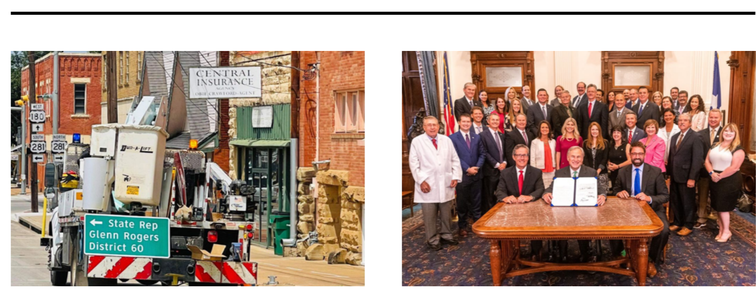
Left Photo: TXDOT installing the House District 60 office sign in Mineral Wells. Right Photo: Representative Rogers at the SB 6 bill signing that would establish limits on certain kinds of liability relating to a pandemic disease or pandemic emergency.

We have been working on opening up 2 of our district offices, one in Brownwood and one in Mineral Wells. There is still work to be done before all district offices are complete. I am looking forward to completing my work in Austin, getting back to the district and visiting with each of you.