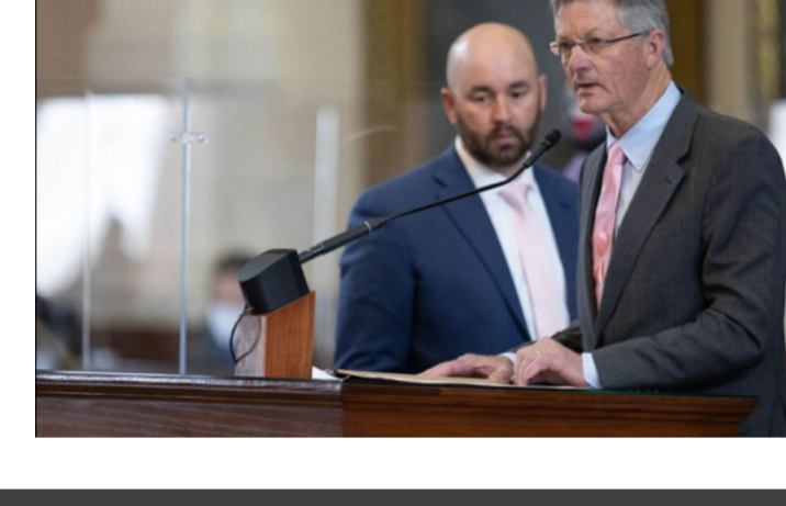
Representative Rogers laying out legislation on the House floor.