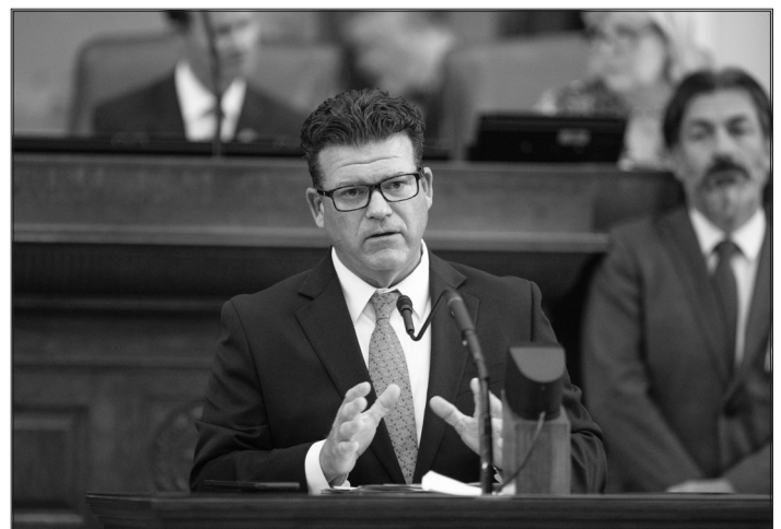
Representative Burns speaking from the front microphone on the House floor.