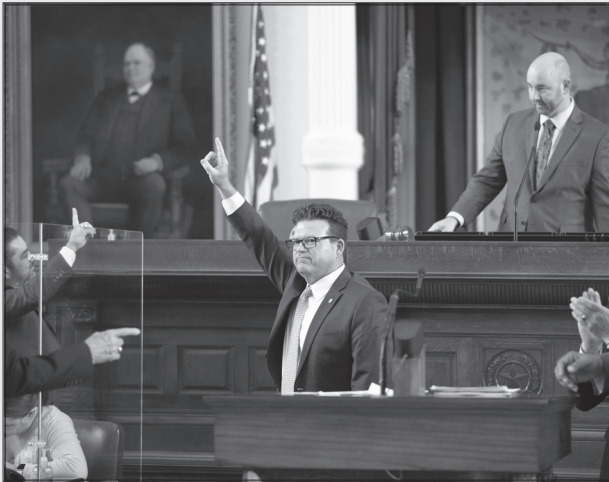
Representative Burns signaling to the House to support a bill on the House floor.