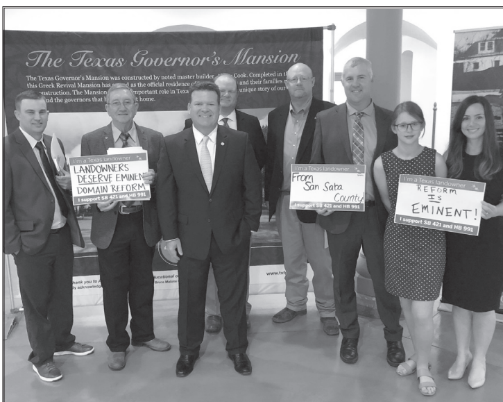
Members of Texas Farm Bureau from across the state to support efforts to reform the eminent domain process and protect private property rights.