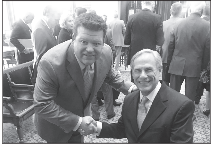
With Governor Greg Abbott.

The State of Texas gives extra weighted funding as an allotment to school districts for students who are engaged in Career and Technical Education programs, such as high school agriculture classes. This funding finances CTE classes and helps them receive additional materials to further students' education in these fields. Historically, the State Board of Education has ruled that 58% of that allotment must go to direct costs for CTE programs and 42% can go to indirect costs. This session, House Bill 3, the major school finance reform bill, would have removed the existing language in statute that required a certain percentage go toward direct costs. In reviewing the details of HB 3, I recognized that removing this language would not ensure the historic minimum funding for these invaluable programs. I authored an amendment that was adopted and will continue to dedicate these funds for CTE programs.