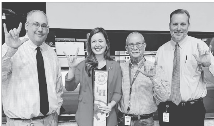
Learning about all the wonderful things going on at Liberty Hill High School.

During the 88th Legislature, I voted to give our public school teachers a $15,000 pay raise. While there was not enough support for the legislation to become law, I will continue to fight to increase public school teacher pay. To highlight a few legislative wins, we increased overall public education funding by $8.9 billion, provided a more comprehensive curriculum option for teachers to help reduce their workload, and gave retired teachers an unprecedented cost of living adjustment as well as an additional $7,500 check for those 75 and older. We also passed the Save Women's Sports Act to protect women by banning biological males from participating in women's sports. I made it a priority to visit with many superintendents and school board members, attend teacher advisory meetings, and tour a number of public schools within our community to understand their needs. We were able to help Taylor ISD strengthen their band program and participated in the groundbreaking of several new public schools. Finally, we passed legislation to establish Texas State Technical College in Hutto as a permanent campus, which will help them expand their opportunities to serve our students in Williamson County and fill important and well-paying job vacancies.