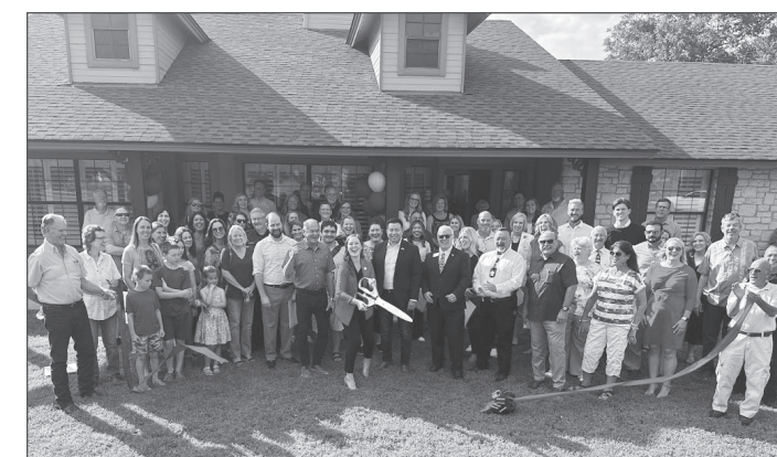
Round Rock District Office Opening Celebration

Our community is home to Samsung, the largest semiconductor investment in North America. We recognize that their work is critical to national security because microchips are used in so many vital ways and we need to ensure we are not dependent on our enemies for their production. We also recognize that their presence in our community has already led to a greater business climate in Williamson County, and has had an especially positive impact on our small businesses. During the 88th Legislative Session we not only passed the Texas CHIPS Act to incentivize more partnerships in manufacturing and technology, we also worked hard to remove red tape for many small businesses by getting rid of the requirement to file onerous franchise tax paperwork with the state. The National Federation of Independent Business recognized these efforts and awarded me the highest 100% rating for supporting small businesses.