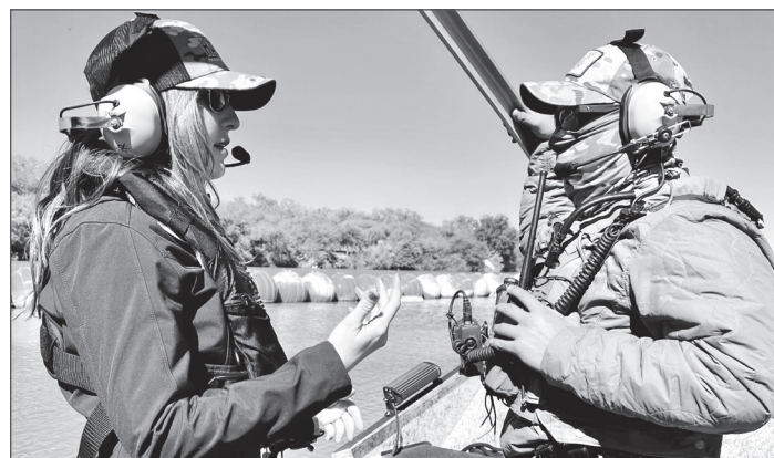
Talking with Border Patrol at our southern border

Our work during the last legislative session included many critical public safety measures, particularly on border security. I traveled to our southern border to see first-hand what our state troopers and state guard needed to help secure our border. After returning to the Capitol, we increased border security funding and passed legislation that created more border barriers, increased the number of state troopers at the border, and enacted stronger penalties for human traffickers and smugglers. In addition, we increased the penalties for dealing fentanyl, equipped schools to educate students on the dangers of fentanyl, and also gave schools the ability to administer life-saving opioid reversal medication on campus. Our public safety work also included making schools safer by increasing funding for security infrastructure and making sure every school has at least one security officer on campus. Along with our legislative work, we