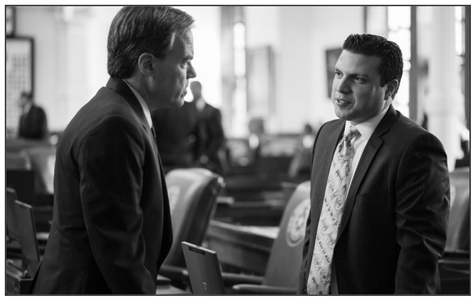
Conferring with Speaker Straus.