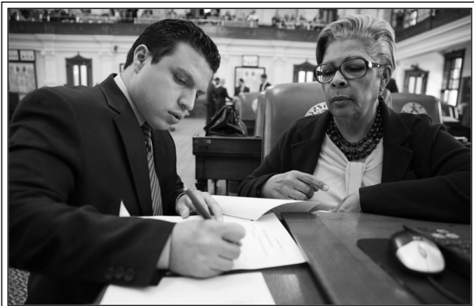
Rep. Muñoz at work with Chairwoman Senfronia Thompson. The two collaborated on human trafficking legislation, budget issues, and other legislative measures.

... And one of Rep. Muñoz' favorite programs, the TEXAS Grants program increased by $135.1 million. Since its inception in 1999, the Towards EXcellence, Access and Success program has succeeded by helping more than 275,000 students go to college.