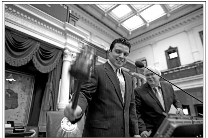
Rep. Muñoz swings the gavel as he presides over the Texas House in the absence of Speaker Straus.

The Legislature passed a Congressional redistricting map during the special session which ended on June 30th. During the regular legislative session, the Legislature passed new district maps for state house districts, state senate districts, and state board of education districts. (These maps can be viewed online at: www.tlc.state.us/redist/redist.html ) Lawsuits concerning these new district boundaries are currently working their way through our court system.