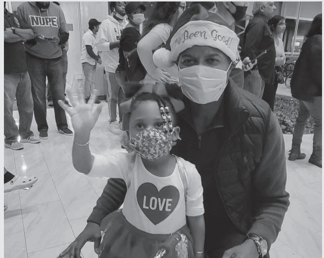
District 27 Annual Holiday Party and Toy Giveaway