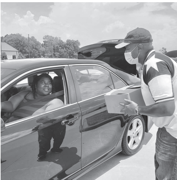
Rep. Reynolds distributing groceries to families in need