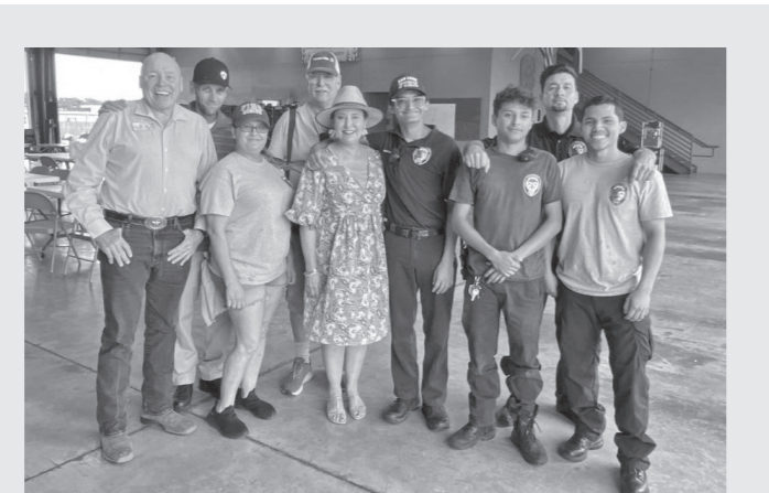
State Representative Terri Leo Wilson attends the San Leon Fire and Rescue Department Open House event.

upcoming legislative session. First, the committee is tasked with monitoring agencies and programs under its jurisdiction, ensuring the effective implementation of legislation passed by the 88th Legislature. This includes active oversight of all associated rulemaking and governmental actions to guarantee the intended legislative outcomes. A significant focus will be on Senate Bill 10, which amends the state statute to enhance benefits for eligible retirees under the Teacher Retirement System of Texas (TRS). As of June 14, 2023, SB 10 provides a one-time stipend for annuitants aged 70 or older by August 31, 2023, with $7,500 allocated for those aged 75 and above, and $2,400 for those aged