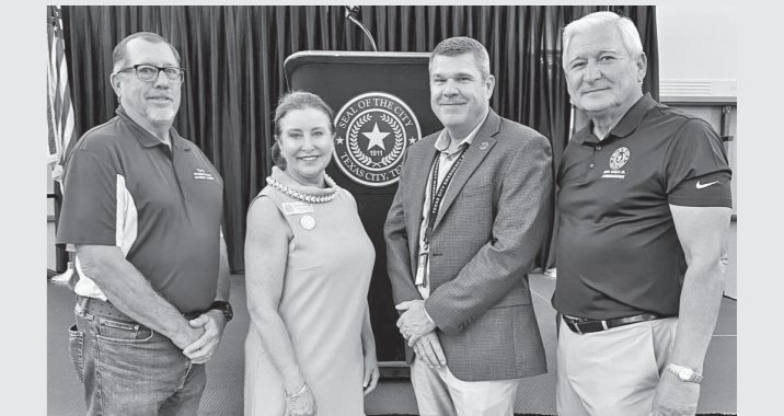
State Representative Terri Leo Wilson attends the Texas City Hurricane Town Hall at Doyle Convention Center. Over 600 people were in attendance and attendees were given hurricane buckets containing essential supplies.