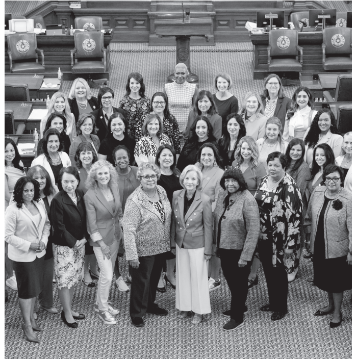
Texas voters sent a historic number of women to serve as members in the Texas House for the 88th Legislature.