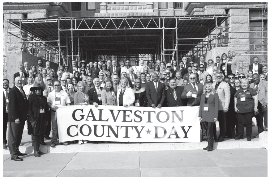
The Galveston County Day delegation visited their State Capitol to meet with their elected officials.