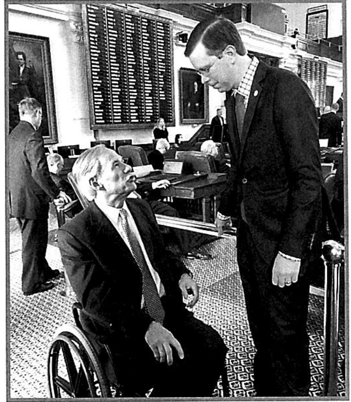
Governor Abbott visits the House floor to discuss legislation with Representative Metcalf.

SB 563 - Requires federal disaster funds, their purpose, and eligibility requirements to be reported to the Texas Water Development Board. The Water Development Board will maintain a central website where Texans can see how much funding is available and the exact eligibility and application requirements for those funds.