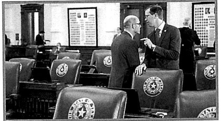
Representative Metcalf discusses policy with Speaker Bonnen.

Through a combined effort of bills, property taxes will be reduced and future growth slowed. Senate Bill 2 is an essential piece needed to ensure that property tax breaks do not evaporate within a year or two, as they have under past attempts to lower property taxes. Senate Bill 2 limits the rate of revenue increases from cities, counties and utility districts from 8% to 3.5% over the previous year without triggering a rollback election. If local revenues increase by more than 3.5% from the previous year, the local taxing entity would be forced to conduct an election to rollback the tax rate to the 3.5% level of gain. SB 2 also expands opportunities for property owners to protest or appeal appraisal values.