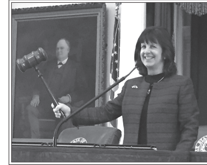
Rep. Swanson presiding over House proceedings