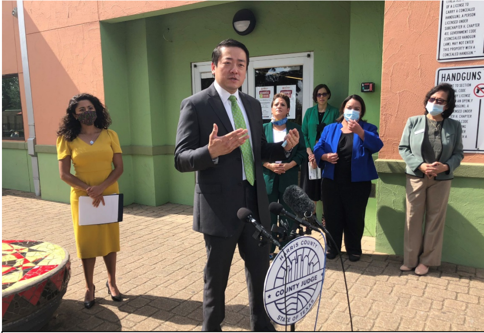
Gene speaking at a Press Conference with Judge Hidalgo and community leaders from the United Way, BakerRipley, and Chinese Community Center to help educate the public on the Child Tax Credit

President Biden's American Rescue Plan increased the Child Tax Credit from $2,000 per child to $3,000 per child for children over the age of six and from $2,000 to $3,600 for children under the age of six, and raised the age limit from 16 to 17.