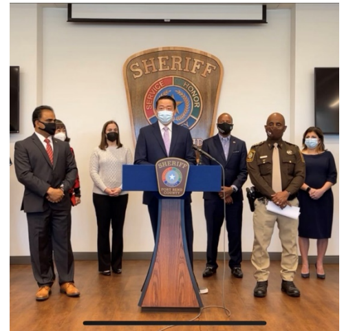
Rep. Wu Speaking at a Stop Asian Hate press conference