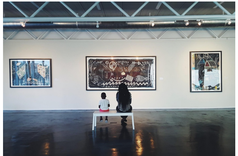
The Houston Museum of African American Culture Location: 4807 Caroline Street, Houston, Texas, 77004

The HMAAC serves as a resource to preserve, promote and celebrate Black history within Houston. The museum is currently taking visitors by appointment only.