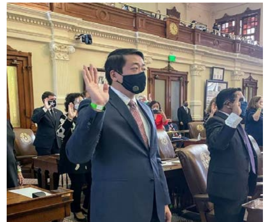
Representative Wu being sworn in on the first day of the 87th Legislative Session.