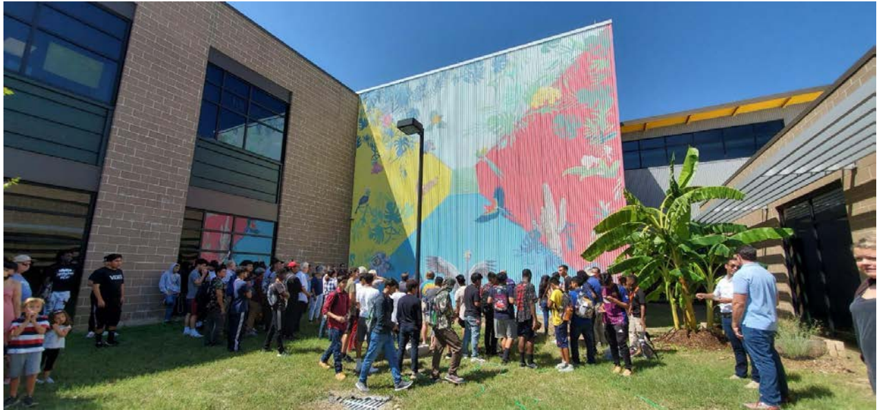
To add to the beauty of their new building, Wisdom HS adds a new community garden and mural for their students

Vox Culture and the Rotary E-Club of Houston hosted the unveiling of the Martin Bailey Garden Project on September 7th at Wisdom High School. The mural was designed by a Houston-based artist and Wisdom High School alumni. The innovative garden uses green technology and provides a space in the school that can produce resources for students while providing an interactive educational area.