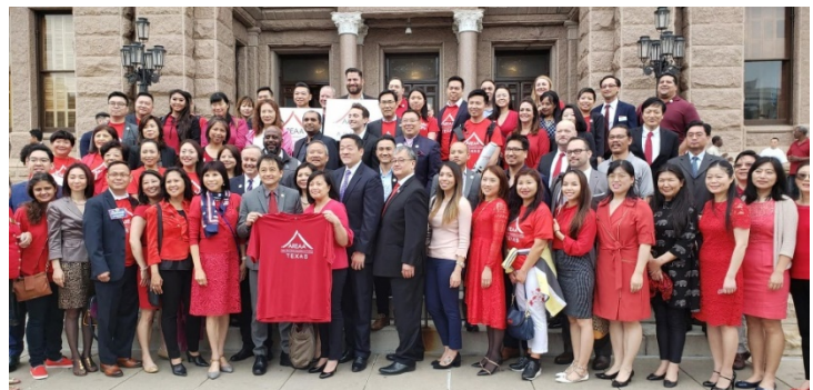
May is Asian American and Pacific Islander Heritage Month. Celebrating Asia Day at the Capitol.