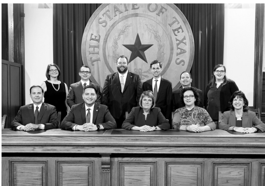
The House Elections Committee Members.

I am honored to serve on the House Elections Committee where we deliberated many bills seeking to protect the integrity of our election system.