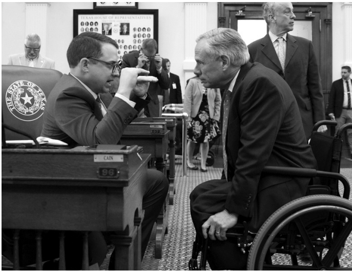
Rep. Cain discussing the property tax system with Gov. Abbott.

Senate Bill 2: Slows property tax increases by limiting the amount of tax revenue that local taxing entities may raise without an election. If the tax revenue growth exceeds 3.5%, then voters will be given the opportunity to oppose such increases in an election for that purpose in November. The 3.5% automatic election trigger is lowered from the 8% “rollback rate,” which includes optional trigger for an election in most taxing entities. The bill contains numerous additional reforms to empower taxpayers such as additional emphasis on informing taxpayers of when and where hearings over proposed tax rates will be held and training improvements for arbitrators who hear property tax appeals.