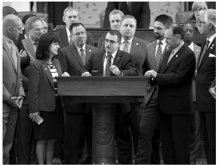
Rep. Cain discussing the merits of policy on the Texas House floor.