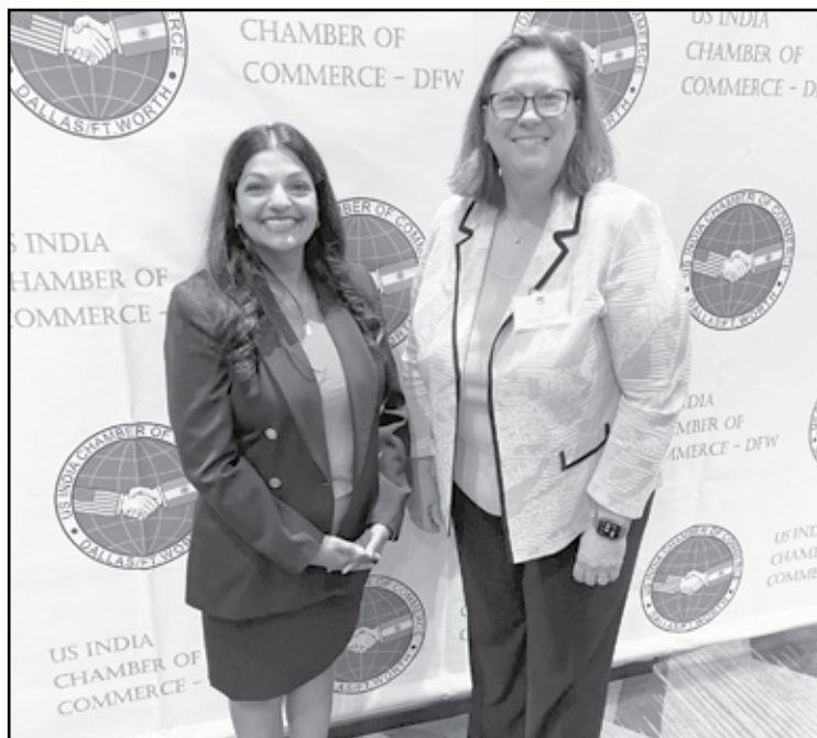
Visit with the U.S. India Chamber of Commerce DFW for their Annual Women's Conference

Last year, the Legislature went through the redistricting process where all Texas House, Texas Senate, Congressional, and State Board of Education seats were redrawn to reflect Texas' increased population. While House District 115 remained relatively intact, many of our constituents will be in a different State Senate District and/or Congressional District. To check all of your district information at the local, state, and federal levels you can visit the Dallas County Elections' Office at www.dallascountyvotes.org . For more information on the redistricting process, you can visit The Texas Legislative Council at redistricting.capitol.texas.gov . As always, you can reach out to our team if you have any questions or need assistance.