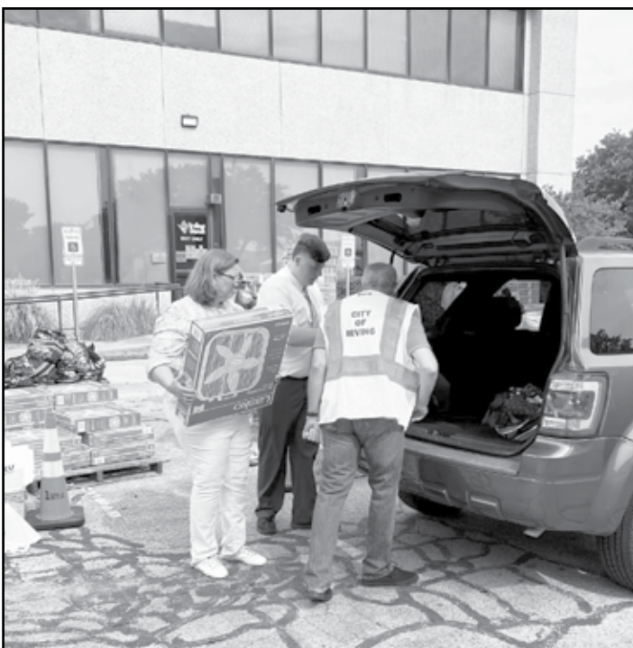
Volunteering at TXU Energy's Beat the Heat event at Irving Cares