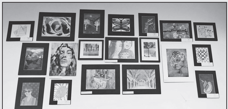
HD 115 student art work wall

We were also able to spotlight District 115 in a unique way in our Capitol office by displaying beautiful artwork by students from the Coppell and Carrollton- Farmers Branch school districts. The arts encourage essential skills needed for a student's development and increases their well-being leading to a more engaged learning experience. As a supporter of the arts in our schools, I was honored to showcase the talents of my young constituents to every visitor we hosted.