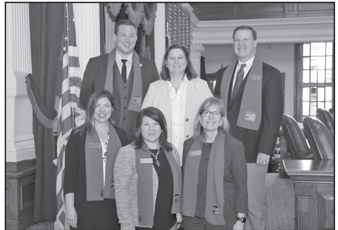
Coppell ISD being honored on the House floor.

Judiciary & Civil Jurisprudence , which has jurisdiction over civil law, civil procedure in the courts of Texas, permission to sue the state, and courts and court procedures. Agencies falling under the purview of this committee include the Supreme Court, the court of appeals, the Texas Judicial Council, the Office of the Attorney General, and the State Office of Administrative Hearings.