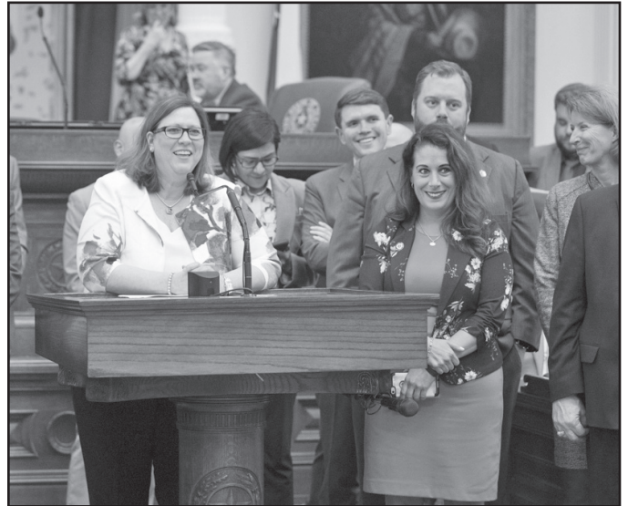
Passage of first bill