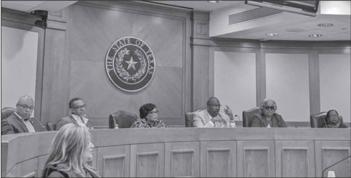
Representative Rose and members of the Texas Legislative Black Caucus meet with Texas Education Agency Commissioner Mike Morath regarding solutions to eliminate the achievement gap for African American Students.