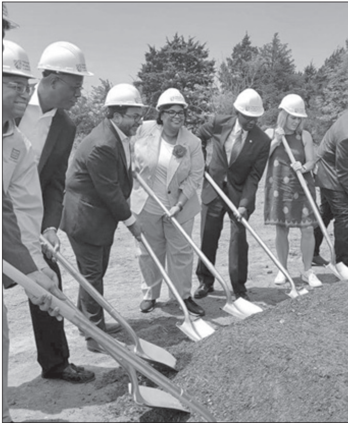
Groundbreaking for Judge Charles R. Rose Community Park