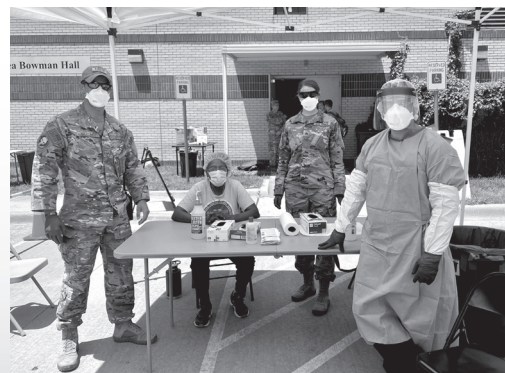
Volunteers and Texas National Reserves at the first Mobile Testing Site in District 110 located at Holy Cross Catholic Church.