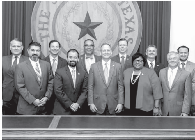
Texas House of Representatives members who were appointed to serve on the House Committee on Calendars.