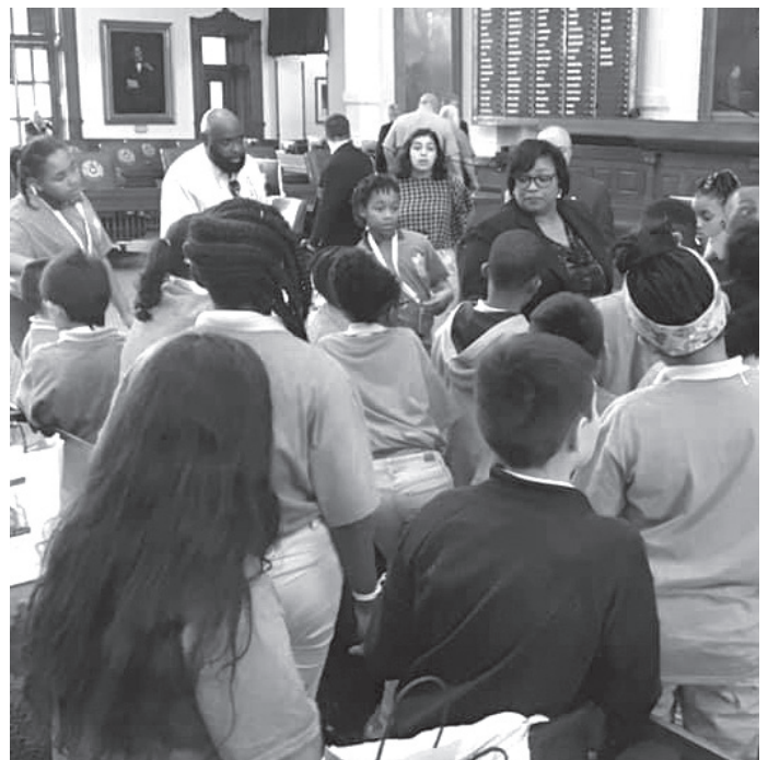
Picture of Rep. Rose talking to T.L. Marsalis Elementary Student Council on the House Floor. Rep. Rose is a proud alumna of T.L. Marsalis Elementary.

The Human Services Committee efforts this legislative session covered shortfalls in Medicaid, foster care, women's health, state hospitals, state-supported living centers, and correctional managed health care. A total of $84.4 billion was allocated to Health and Human Services. This includes, but not limited to: $145 million allocated to programs for adults and children with intellectual or developmental disabilities (IDD); $48 million for rate increases and cost growth for Early Childhood Intervention; and a 24% increase of funding to support women's health.