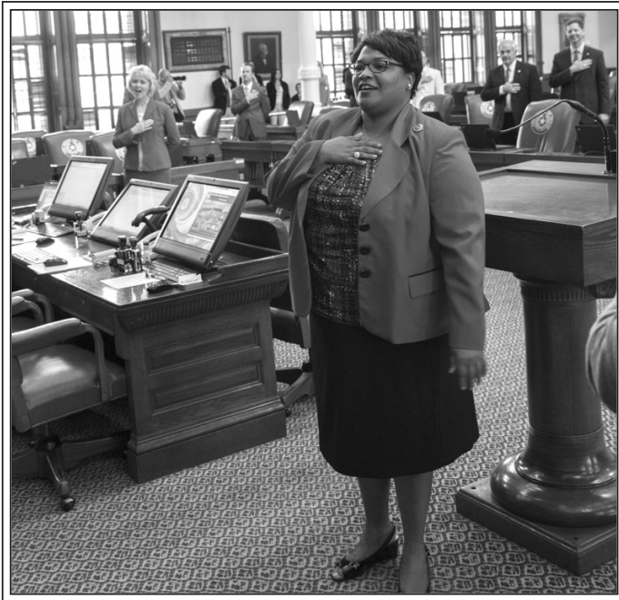
Representative Rose leading the Pledge of Allegiance at the opening of House Proceedings.

The provision of the proposed amendment prohibiting a transfer tax on real estate transactions is unnecessary because such transactions are not currently subject to taxation, nor is such a tax currently under consideration. Furthermore, the provision is unwise in that it precludes a future legislature from considering such a tax as a means of addressing a revenue shortfall. Finally, it singles out one particular type of transaction for special treatment when no similar protection is provided for transactions in other goods that are just as essential, including food and medicine.