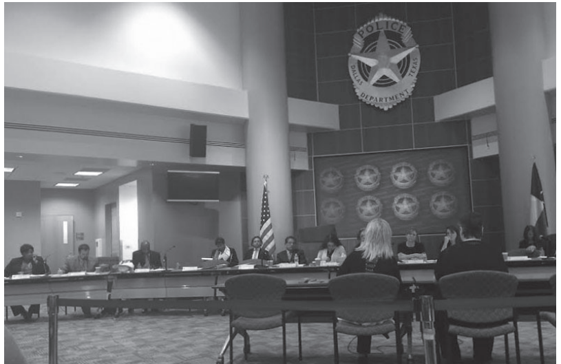
The Joint Select Committee on Human Trafficking held one of several hearings to learn more about this issue in Dallas, TX on September 25, 2014.

The legislature will also look at raising the age of juvenile jurisdiction from 17 to 18 years of age. This change would mean that 18 years of age would become the age in which a person may be charged as an adult for a criminal offense. Deciding whether to