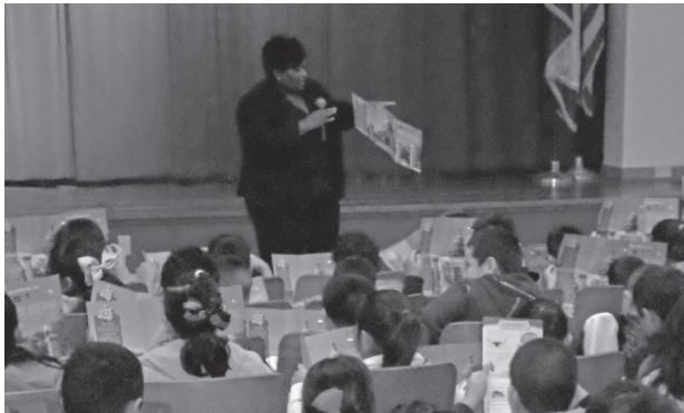
John Runyon Elementary students were amazed by all the facts the representative shared about the state of Texas.