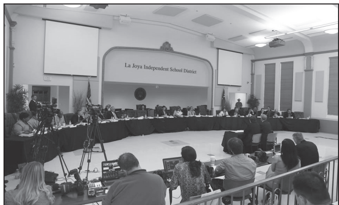
Members of the Joint Committee on Human Trafficking gather in McAllen to hear testimony from state agencies and constituents regarding this growing issue.