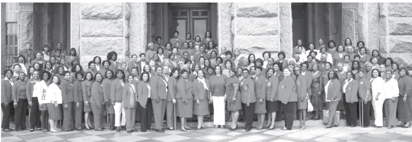
Representative Rose welcomed over 180 members of Delta Sigma Theta Sorority, Inc. to the Capitol for their Bi-Annual Red and White Day. "Educate! Employ! Empower! Celebrating 100 Years of Public Service in Texas!" was the theme of the day as the Deltas' laid out their legislative agenda to the 83rd Texas Legislature.

VISITING THE CAPITOL The State Capitol is open to the public year round with the exception of major holidays. Free guided tours are offered Monday through Friday 8:30am- 4:30pm; 9:30am - 4:30pm Saturdays and Noon to 3:30pm on Sundays. Tour reservations for groups of 10 or more can be made by contacting the Capitol Visitors Center at 512-305-8400.