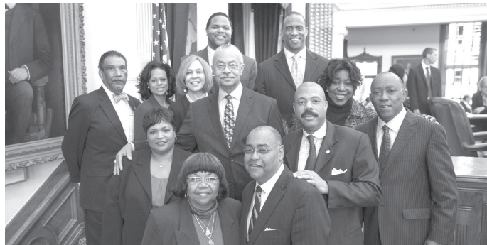
Honorable Curtis Graves (center) the first African American to serve in the Texas House of Representatives since Reconstruction, with Representative Rose and other legislators during his visit to the House Chamber in February.

$3.9 billion was restored to public education during this session. House Bill 5 reduces the number of end-of year course exams needed for graduation from 15 to 5. The required tests will be algebra, biology, U.S. history and 10th grade reading and writing. Senate Bill 376 would require all schools and school districts, where more than 80 percent of students are already eligible for free or reduced-price meals through the federal School Breakfast Program, to offer a free breakfast to all students. Senate Bill 2 allows for an increase of 90 additional charter schools before 2019. The bill also gives the Texas Education Agency new authority to regulate low-performing charter schools and close them if they are academically unacceptable for three straight years.