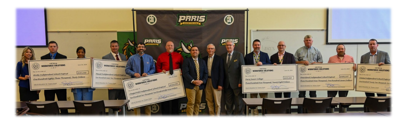
Awardees and participants at the JET Grant ceremony at PJC.

Almost 10 years ago, the 84<sup>th</sup> legislature adopted House Bill 3062 (84<sup>th</sup>; 2015) to expand the Jobs for Texas Grant Program (JET Grants) to include school districts as partners with community colleges and technical schools to broaden educational opportunities and technical program offerings for Texans looking for a promising career field or educational pathway. The bill allowed for program participants to receive funds to