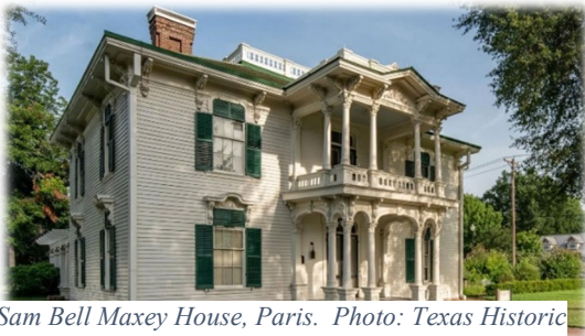
Sam Bell Maxey House, Paris.

Texas Historic Commission (THC) – summer activities – Sam Bell Maxey House. The THC ( https://thc.texas.gov/ ) recently informed my office about their summer activities around the state, including one close to home, with a historic journey as part of their Youth Summer Camps. THC says that young historians can participate in a unique blend of education and adventure, where the past comes to life! Their curated camps offer hands-on experience, allowing campers to step back in time and discover the rich heritage of Texas. Each