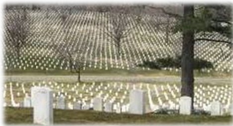
Arlington National Cemetery.

Texans may enroll in the plan at any time between Sept. 1 and Feb. 28 (Feb. 29 in leap years). Enrollment for children younger than 1 year of age extends through July 31 . Check out the information on the prepaid tuition plan at: https://www.texastuitionpromisefund.com/ .