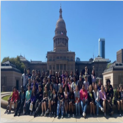
Texarkana ISD's Texas High School band at the Capitol.