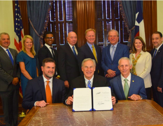
Governor Abbott signed HB 8 on June 9, 2023.

Legislative successes. These are the eight bills I passed this session: