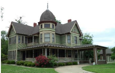
The Lennox Home, Clarksville, Texas.

If you would like more information, please refer to the information at this link: Texas Armed Services Scholarship Program .