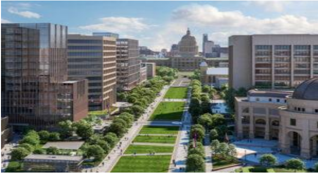
View of new Texas Capitol Mall