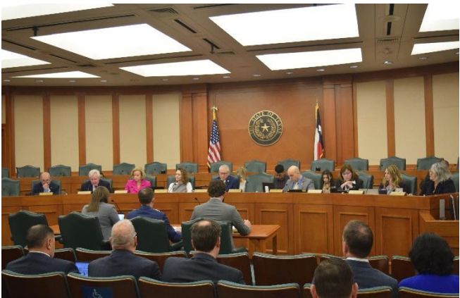
Chair VanDeaver and the Article III subcommittee hard at work.

Work recently began on the Phase II portion of the Master Plan that will add two additional office buildings along 15th Street just west of Congress Avenue. The project is being managed by the Texas Facilities Commission. Use this link to watch the progress on this exciting addition to the Capitol Complex and take a virtual construction tour: https://www.tfc-ccp.org/virtual-construction-tour/ .