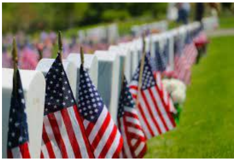
The United States National Cemetery.

Memorial Day. Originally called, “Decoration Day.” In 1869, the head of an organization of Union veterans, Major General John A. Logan, established Decoration Day as a way for the nation to honor the graves of those who died in the Civil War with flowers, according to the U.S. Department of Veterans Affairs.