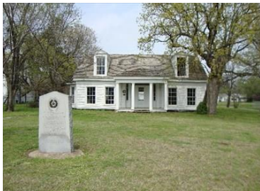
The DeMorse Home, Clarksville, Texas.

“The TWDB shall evaluate the feasibility of the proposed Marvin Nichols Reservoir project to be located on the Sulphur River and upstream of the confluence of the White Oak Creek in Franklin, Titus, and Red River Counties. The review shall