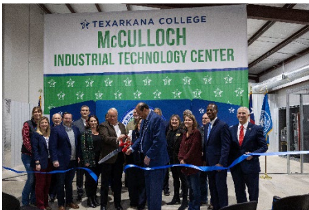
The official opening of the McCulloch Industrial Technology Center on 02/10/23.

TC opens a new training facility. Texarkana College (TC) recently opened its new training facility for Electrical Technology and Heating, Ventilation, and Air Conditioning (HVAC) programs in the new McCulloch Industrial Technology Center. This new 15,000-square-foot building provides a state-of-the-art training facility that replicates the equipment used in today's residential, commercial, and industrial construction projects. The McCulloch family, the owners of Wholesale Electric Supply Company, Inc., donated funds to build the facility and helped provide training equipment for students. Thank you to the McCullough family for their generous donations and support.