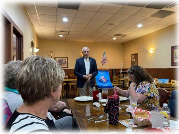
Rep. VanDeaver speaking at Atlanta Area Rotary Club, Luigi's Italian Restaurant. Atlanta, TX. (Photo Credit to Atlanta Area Rotary Club).

Atlanta Area Rotary Club. On April 14th, I spoke at the Atlanta Area Rotary Club at Luigi's Italian Restaurant in downtown Atlanta. We discussed the legislative process, the issues that the legislature handled in 2021, and how the state and congressional districts changed. All of Cass County was shifted into Texas House District 1 and Congressional District 4, changing both their state and congressional representation. It was wonderful meeting more service-minded folks in the new parts of HD 1.