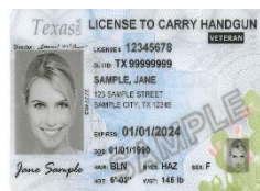
New License to Carry design.

As part of the redesign, the Texas License to Carry (LTC) Handgun cards will also debut a new look and new features, including laser engraving and a durable, tamper-resistant polycarbonate