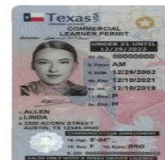
New Learner's Permit design.

As a reminder, beginning Oct. 1, 2020, you'll need a valid passport, U.S. military ID or a REAL ID compliant driver license (one with the gold star) to travel on commercial airlines or enter federal facilities.