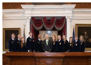
Rep. VanDeaver and the 2019-20 FFA state officers on the Speaker's dais in the House Chamber; photo: House Photography.

In addition to changing its space plans for their IMD at the meeting on February 21, the TRS board awarded new contracts for managers of the system's health insurance programs TRS-Care and TRS-Care Standard (for retirees) and TRS-ActiveCare (for current school employees). These changes are projected to save the system $754 million over the next three to five years. According to the TRS press release, Blue Cross & Blue Shield of Texas will administer both the TRS-ActiveCare and TRS-Care Standard (plan for retirees under the age of 65 who do not qualify yet for Medicare). United Health Care will take over the management of the TRS-Care Medicare Advantage program and is projected to save $314 million over the next five years. All of these programs have faced significant funding challenges over the years. According to TRS, the TRS-ActiveCare transition to Blue Cross Blue Shield will take effect on September 1, 2020. The other programs (TRS-Care Standard and TRS-Care) will transition to the new providers on January 1, 2021. For more details, visit: https://www.trs.texas.gov/Pages/trsvendorchanges2021.aspx .