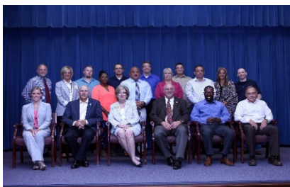
Graduates and attendees at the RRAD logistics management graduation ceremony.

Certificate Program graduation. On July 12, I had the pleasure of speaking to the 13 graduates of the Red River Army Depot (RRAD) Logistics Management Certificate program.