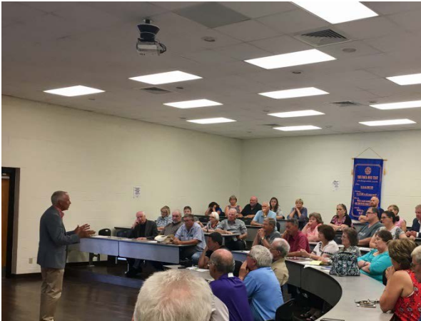
(Rep. VanDeaver at the Mount Vernon Town Hall meeting.)

the regular session, I filed bills ( HB 168 & HB 486 , respectively) that would have allowed local school districts that previously passed a tax ratification election (TRE) to lower their tax rate without having another election if they later needed to return to the previously voter-approved rate. HB 486 passed the House but was never heard in the Senate. HB 168 passed the House Ways & Means Committee but was never scheduled for a House vote.