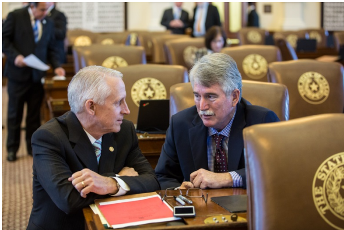
(Rep. VanDeaver talking with House colleague, Rep. J.D. Sheffield (Gatesville) in the House Chamber.)

More detailed information will be available later this fall from the Texas Legislative Council at http://www.tlc.texas.gov/const_amends .