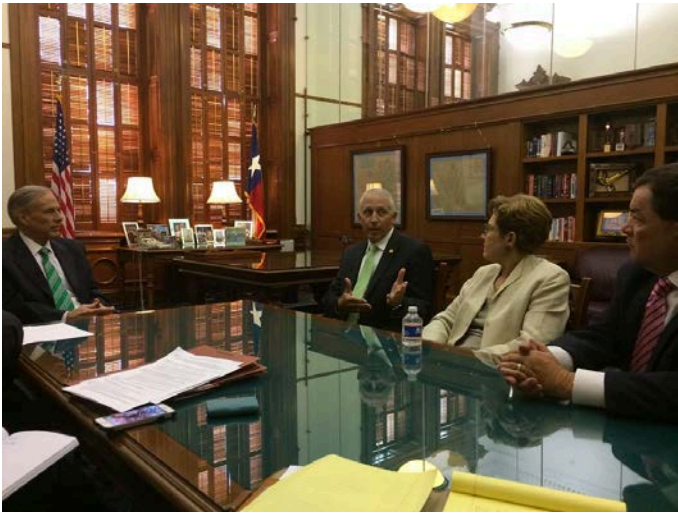
(L-r: Governor Abbott, Reps. VanDeaver, Koop & King talking about issues during the special session.)

passed and continues not only the TMB, but also the Board of Examiners of Psychologists, Board of Examiners of Marriage and Family Therapists, Board of Examiners of Professional Counselors, and Board of Social Workers Examiners until September 1, 2019. These agencies will go through another round of sunset review by the legislature in 2019.