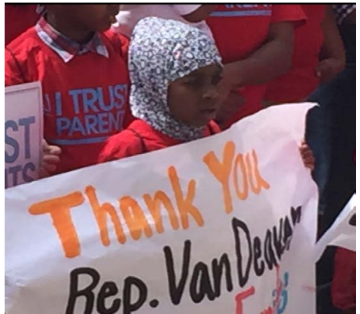
(Public education supporters rallying at the Capitol.)

Proposition 1 (H.J.R. 21) - to authorize the legislature to provide for an exemption from ad valorem taxation of part of the market value of the residence homestead of a partially disabled veteran or the surviving spouse of a partially disabled veteran if the residence homestead was donated to the disabled veteran by a charitable organization for less than the market value of the residence homestead and harmonizing certain related provisions of the Texas Constitution.