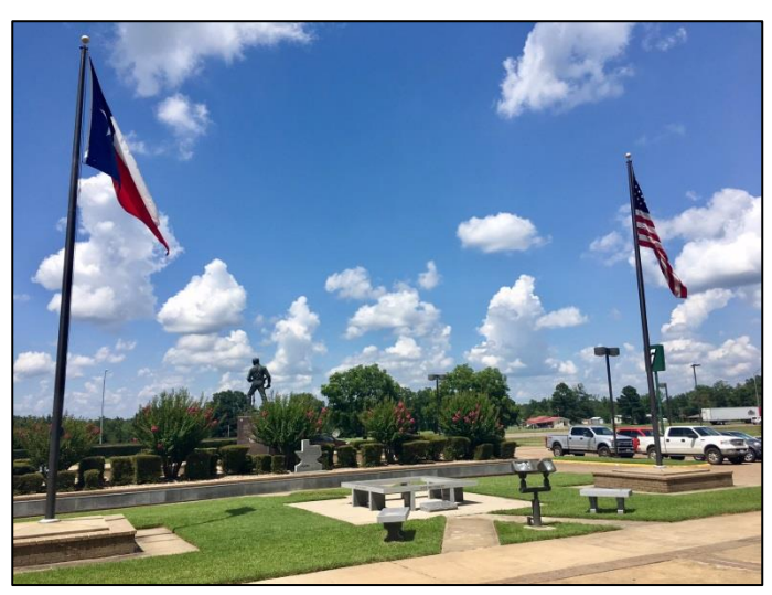
Bowie County Courthouse.

My office is here to help. I thank each of you for letting me serve you as your state representative. Please contact either the District office (903-628-0361) or Capitol office (512-463-0692) if there is anything you think we can do to help you.