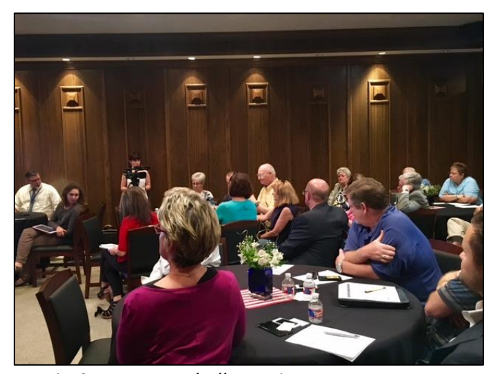
Bowie County town hall meeting.

Current results of the constituent survey reviewed at the town hall meetings indicate that passage of sunset legislation is largely agreed upon in House District 1. Additionally, the results show it is widely believed that teachers should receive a pay raise. But, there were several comments that this pay raise should be funded by the state and should not be an unfunded mandate on school districts. Additionally, pro-life issues as well as property tax relief were clear priorities of respondents based on the survey results.