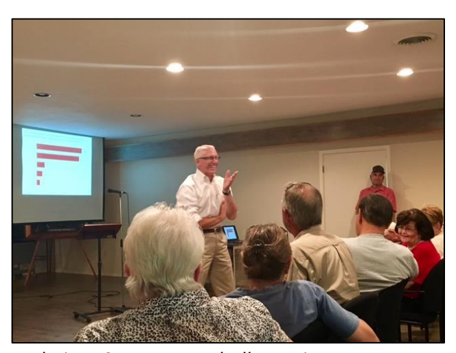
Red River County town hall meeting.

Around the District. Town Hall meetings. I want to thank everyone who attended my Town Hall meetings last week in each of my four counties. I especially want to thank my hosts that provided the meeting space and refreshments for attendees in Clarksville, Paris, Texarkana and Mount Vernon. I felt the attendance was good at each of the meetings. In addition to providing a summary of the recently completed legislative session, I also had a chance to discuss the upcoming special session and share the results of a survey done by my office about those issues. It is very helpful for me to hear directly from my constituents.