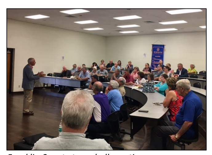
Franklin County town hall meeting.

Current results of the constituent survey reviewed at the town hall meetings indicate that passage of sunset legislation is largely agreed upon in House District 1. Additionally, the results show it is widely believed that teachers should receive a pay raise. But, there were several comments that this pay raise should be funded by the state and should not be an unfunded mandate on school districts. Additionally, pro-life issues as well as property tax relief were clear priorities of respondents based on the survey results.