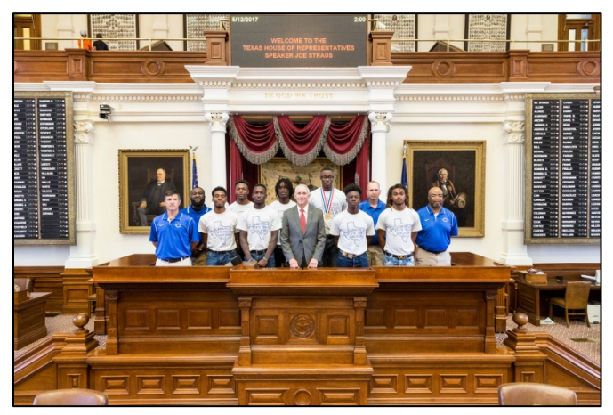
Clarksville ISD track team

Time running short. There is less than one week left in the regular session of the 85th Texas Legislature and a lot of work still needs to be finished. Tensions between the House of Representatives and Senate remain high as members work to get their version of legislation passed in time for significant deadlines. This session has a very different feel to it than my freshman session in 2015, especially since the amount of available revenue this session is significantly less than two years ago.