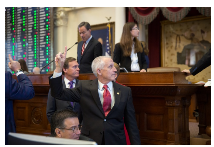
Rep. VanDeaver voting on the House floor; photo by the Texas House of Representatives.

Priority legislation. Last fall, voters sent legislators to Austin to enact laws protecting our children and our pocket books. This weekend the Texas House took steps to meet those obligations by amending and passing SB 669 - The Property Taxpayer Empowerment Act of 2017 and SB 8 - The Partial Birth - Abortion Ban. The differences in the House version of these bills and the Senate versions will have to be worked out this week in conference committees before the legislature adjourns on May 29.