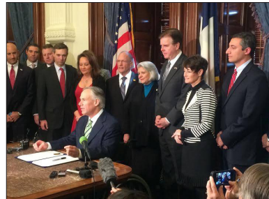
Governor Abbott formally proclaimed February 2, 2015 to be Chris Kyle Day.

The Local & Consent Calendars Committee sets the order for all local bills. Most bills the House deal with go through Local & Consent Calendars.