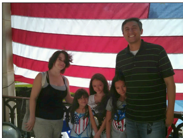
This summer, our family took a long road trip and visited several state capitols (we visited nine in July). It turned out to be a great way to study our nation's history.

"Summer afternoon—summer afternoon; to me those have always been the two most beautiful words in the English language." - Henry James