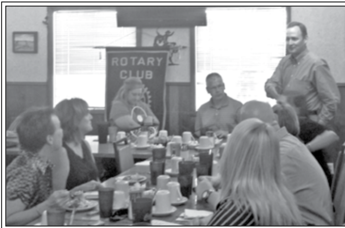
Visiting with constituents following the session

Our Texas forefathers got it right when they constitutionally required the Texas Legislature to meet every other year for a limited number of days because this ensures that very few bills will pass and state government, as a result, will be more limited. As a result of the Texas Constitution, state representatives and state senators are truly citizen legislators in that we come home to live and work under the laws we created.