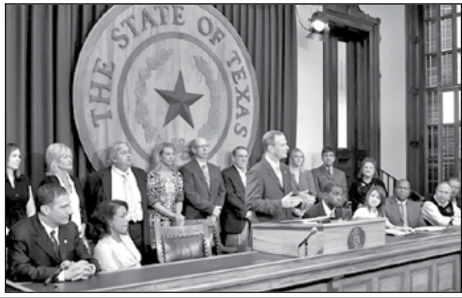
Press conference on legislation

I am proud that many of the bills I authored, coauthored, and sponsored were signed into law. A few are summarized below.