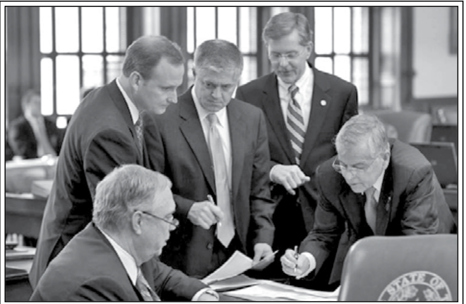
Working on redistricting with West Texas delegation

House members from the Panhandle and West Texas worked together tirelessly to ensure that our region could retain as many house seats as possible given the explosive population growth in the suburban counties near the DFW, Austin/San Antonio, and Houston triangle. We did very well in that we only lost one seat when two or more seats were in jeopardy. Under the map as passed into law by the Legislature, our House District 87 would still consist of Carson, Moore, Sherman, and Potter counties. The new map adds Hutchinson county to District 87.