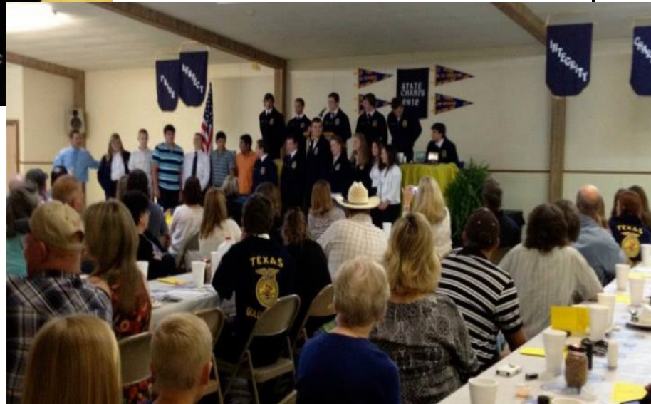
Goldthwaite Future Farmers of America Banquet